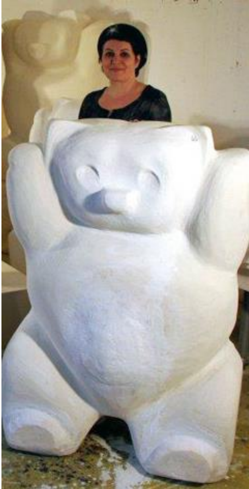
Sunray Lovable as a perfect raw sculpture. The dusty and physically exhausting sculpting is finished.