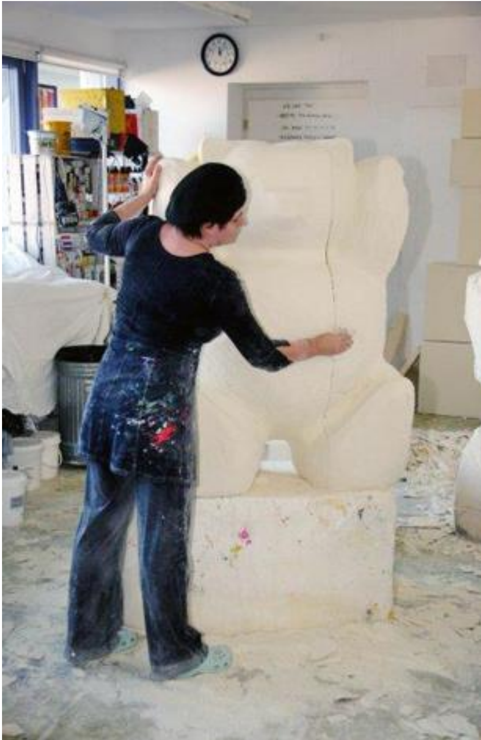
Working on the solid polyurethane sculpture of Sunray Lovable, she is slowly shaping the form.