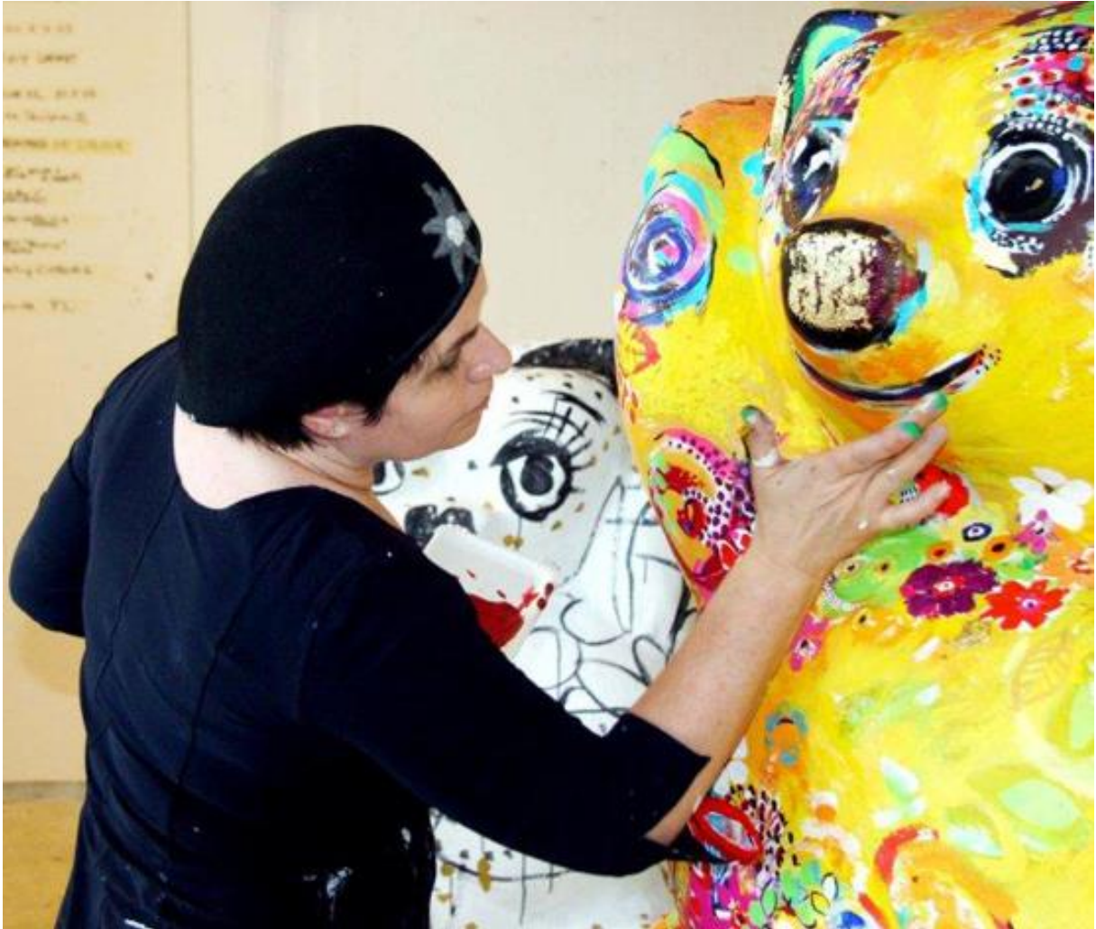
Once the fiberglass sculpture is back at her studio the painting can begin, here on Sunray Lovable.