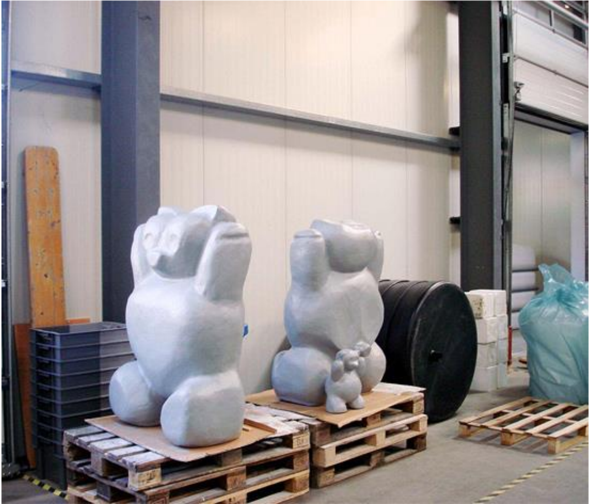
The fiberglass surface protects the solid polyurethane core and provides a long lasting, timeless quality.