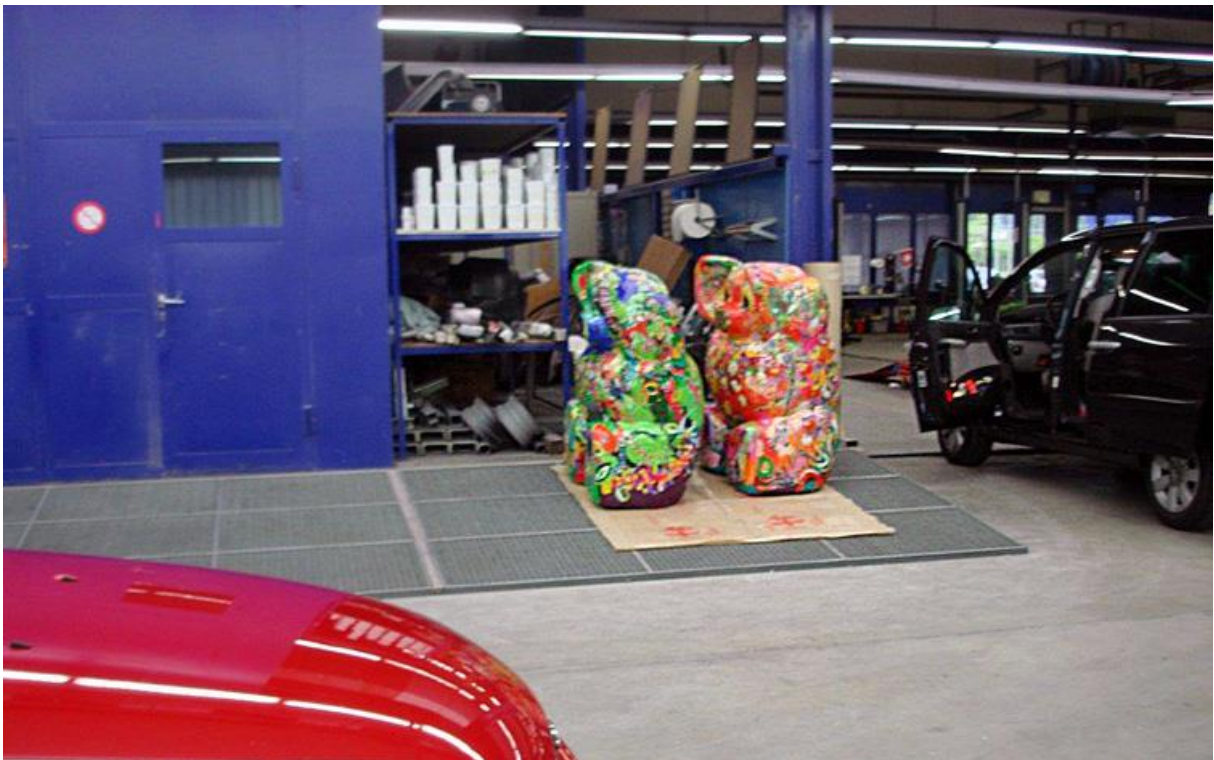
Treetop Lovable and Sweet Blossom Lovable are ready for their spray protection at the Citroen Garage.