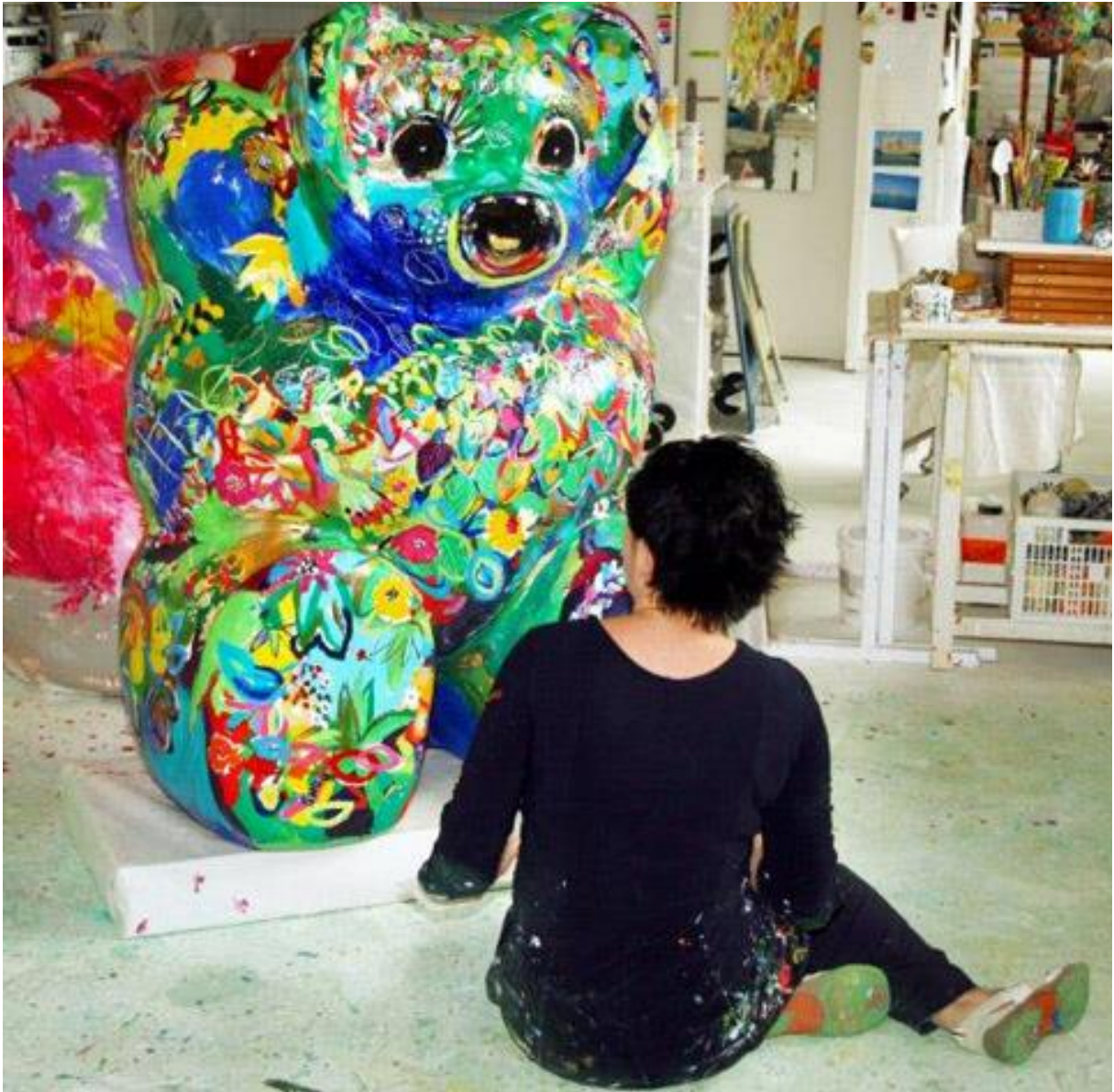
Painting on Treetop Lovable, the elements of pure gold are applied last. Gold has a wonderful way of catching the light in such a way, that the sculpture appears to be alive and moving.